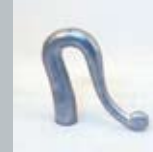
Aluminum shepherd's crook