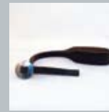
Leather lanyard and concho