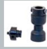
Rifle rapid pivot mount