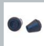
Rubber feet (13mm or 9.5mm)