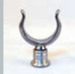
Metal lyre yoke