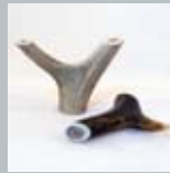
Antler yoke with cartridge magnets