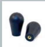
Oval ball knob