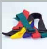
Webbing strap (5 colours)