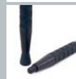
Weighted wading tip