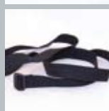
Wading staff strap