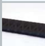
Replacement hand grip