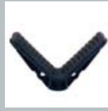
Rubber over moulded yoke